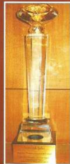
Winner of National Tourism Award of Excellence by Ministry of Tourism, Govt. of India

This is an all inclusive package tour by an exclusive Air Conditioned train which includes all meals, road transfers, sight seeing, visits to the religious places. Special care is taken to maintain high level of security and extend a high standard of service both on the train and off the train.